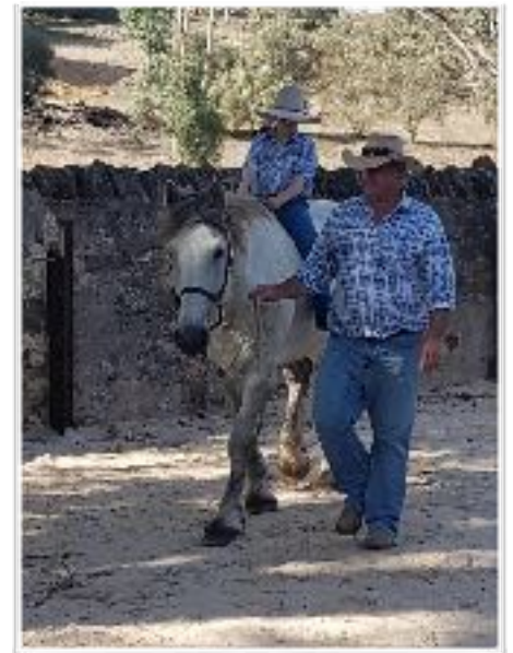
Pony Rides at Kadlunga, 2018