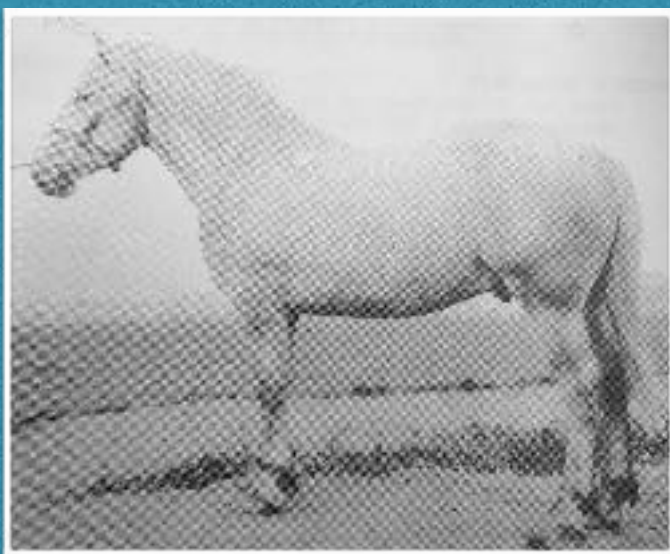
'Larigot' (s. Galbo x d. Mignonne)